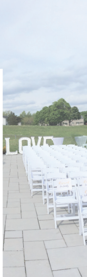
YOUR VOWS WITH A VIEW